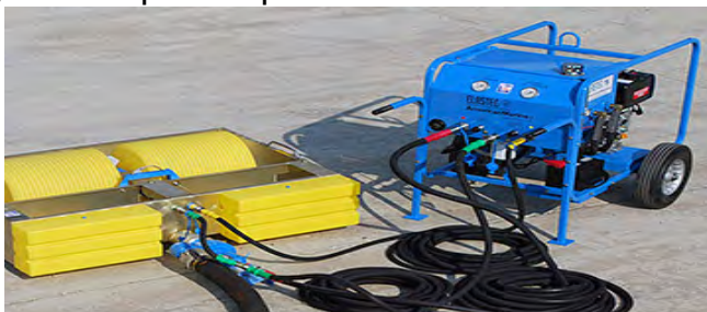
Skimmer with S/E150 pump and S/D10 diesel hydraulic power pack.

Hydraulically operated skimmers may be delivered with a diesel or electric driven hydraulic power pack.