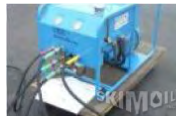
10 electric hydraulic power pack