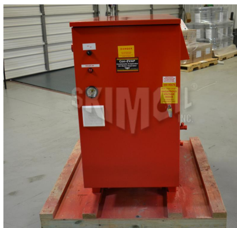
ConEVAP Condensate Evaporator