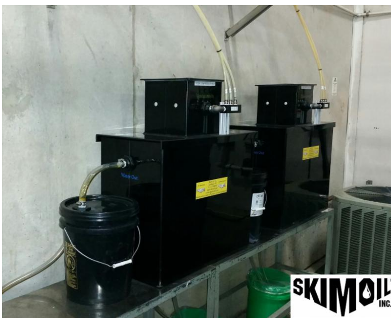
Compressor Condensate Oil Water Separator