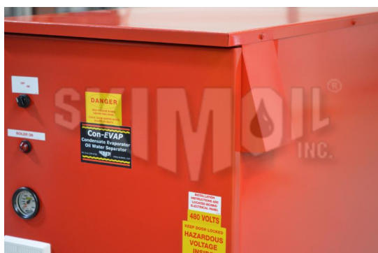
ConEVAP Condensate Evaporator

https://www.skimoil.com/compressor-condensate-evaporators