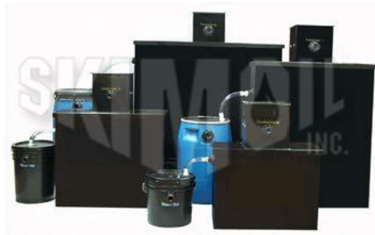
Compressor Condensate Oil Water Separator

Most compressors do allow some oils get into the condensate blow down...it's just part of the process. People used to actually be able to simply blow that out onto the ground. That doesn't play anymore. If you do this....don't get caught and fix the situation right away or you may see your name on the 6:00 News.....and that's just the beginning!